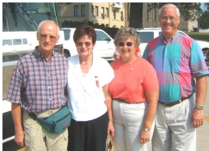
Memories from the past!!!

(Information found in the Deutscher Verein Archives)