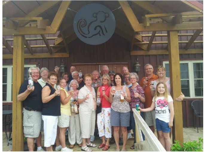
Memories from the past!!!!

Dudine STOCKSTADT Hochgesang LEBANHAN Pfeffer RUHLKIRCHEN State of Lower Saxony Eversman ALFAUSEN FRANCE ALSACE Ruxer REICHSTETT Heidelbach DISTELDORF Weinzaphel UNGERSHEIM