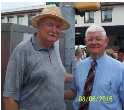
Memories from the past!!!!

I want my gift to be in memory of / in honor of: _____