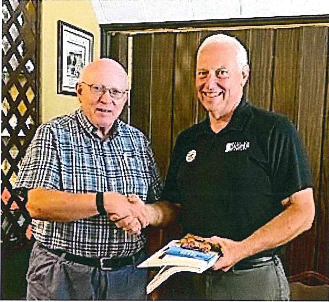
Consul General Wolfgang Moessinger and Mayor Dean Vonderheide