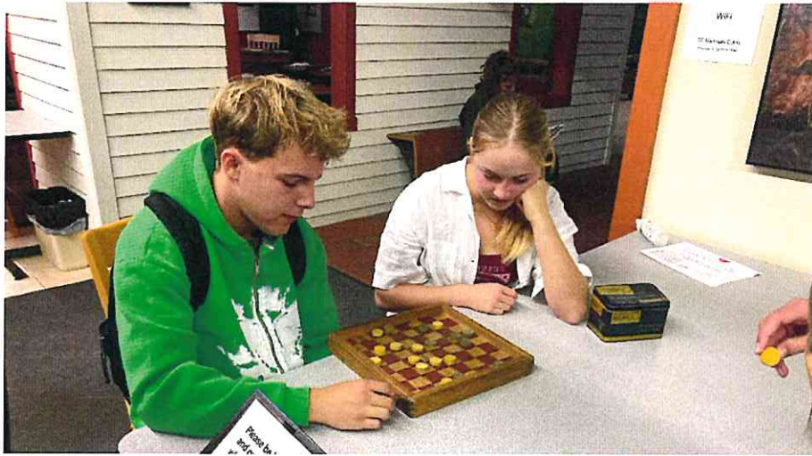
And, now Gruppe 20 begins with their fundraiser on September 25 th !!!!