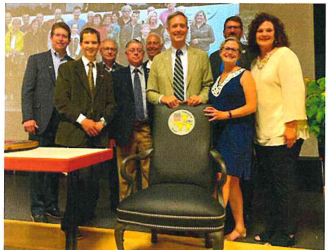
US Consul General to Germany, his wife, Mayor of Jasper, President of Sister Cities of Jasper, President Jasper German Club, President of Jasper Partnership Commission, JHS German Teacher, Sister Cities of Jasper Board Members

When the Partnership Celebrations occur, it is the tradition for the two communities to exchange gifts. This year's gift of a chair from Indiana Furniture represents Jasper's historical connection to Pfaffenweiler and is representative of the furniture manufacturing that is prevalent in Jasper. Indiana Furniture was founded in 1905 as Jasper Novelty Works by many of the original immigrants from Pfaffenweiler.