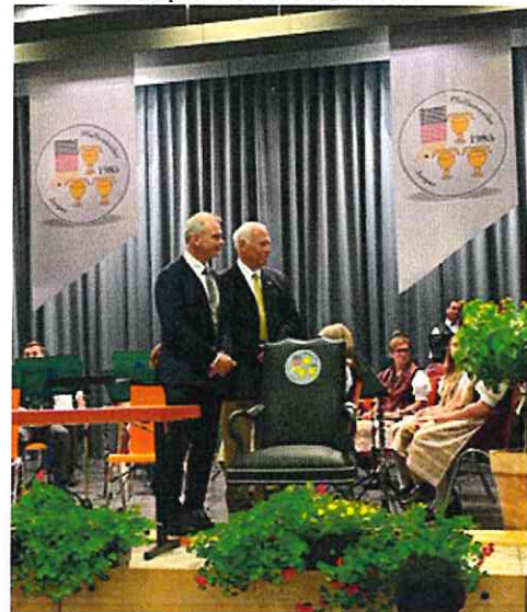
Mayors of Pfaffenweiler and Jasper