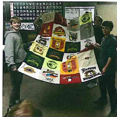
JHS Students showing off lovingly-handcrafted Strassenfest blanket