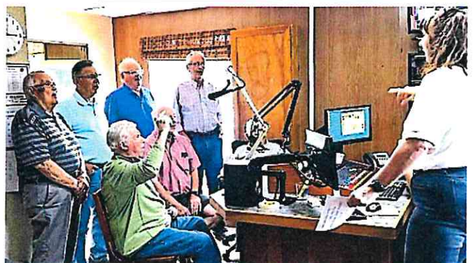
DeutscherVerein members taping for a Strassenfest broadcast!!!!