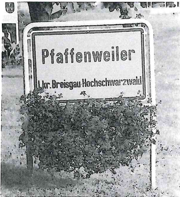
Entrance sign to Pfaffenweiler Ortsschild Pfaffenweiler