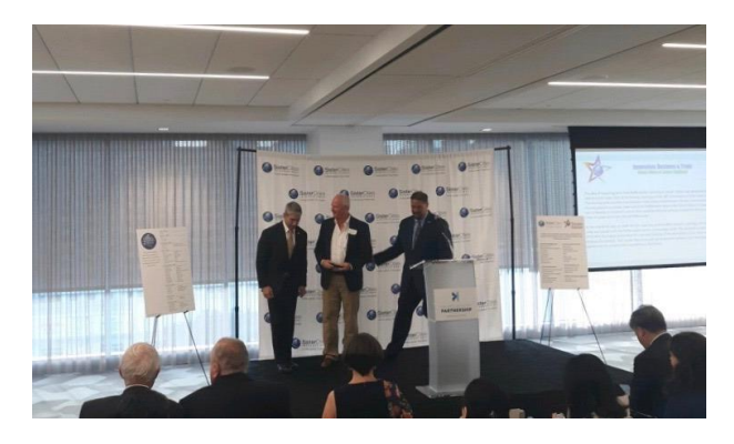
Sister Cities of Jasper, Inc. received the Indiana Sister Cities award for Best Program 2019 for importing Pfaffenweiler wine at the Indiana Sister Cities Symposium on September 7<sup>th</sup>.